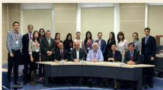
Representatives of KIDI, NFYDE, EFCE and COMPETITIVENESS

During the first Module were given lectures and further discussions on Cluster Economics and Cluster Initiative Screenings , on the basis of case studies. During the afternoon sessions, the lessons learned during the morning were concreted according the Kazakhstan specificities, needs and concerns. All the training was made combining the theoretical aspects with a very interactive approach to make the training experience as lively and fruitful as possible.