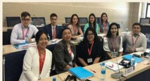
Module Training on cluster economy and selection initiatives