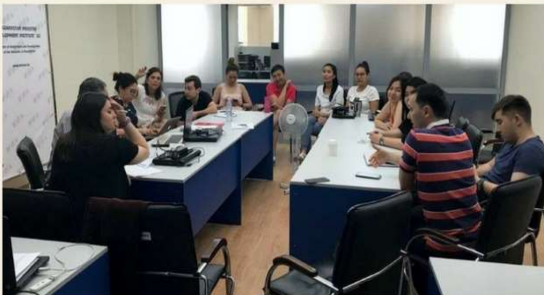
Meeting of JSC "KIDI" with INFYDE on territorial clusters selection methodology.

After carrying out the selection procedure, the Industrial Development Commission of the Republic of Kazakhstan with the Prime Minister of the Republic of Kazakhstan will determine 6 pilot territorial clusters. Then the team of JSC "KIDI" together with INFYDE in 2017-2019 will proceed with the implementation of the activities planned for the project.