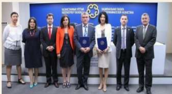
Memorandum of Understanding and Cooperation

On 26th June in NCE of Kazakhstan "Atameken" was signed a Memorandum of Understanding and Cooperation between JSC "Kazakhstan Industry Development Institute" (KIDI) and National Chamber of Entrepreneurs "Atameken" .