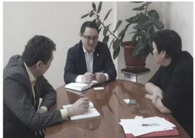
Representatives of KIDI visiting the City of North Kazakhstan