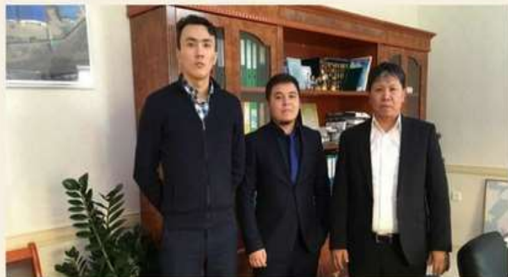
Representatives of KIDI visiting the City of Kyzylorda