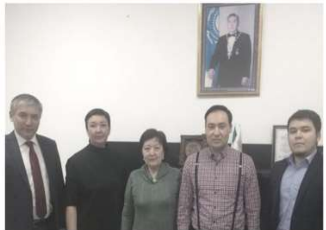
Representatives of KIDI visiting the City of South Kazakhstan