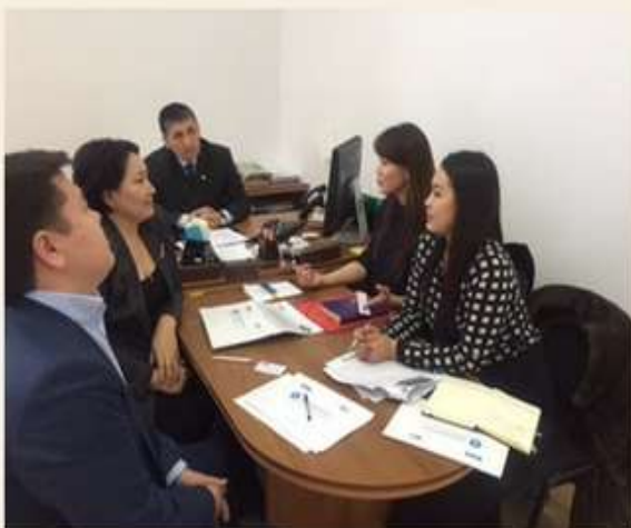
Representatives of KIDI visiting the City of Aktau