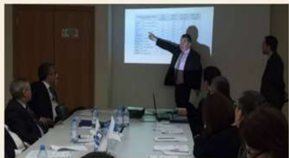
Representatives of the following Institutions: Ministry of Energy of the Republic of Kazakhstan (the responsible authority for the development of the national clusters), Ministry of Culture and Sports of the Republic of Kazakhstan (the responsible authority for the development of tourism), Kazakhstan Union of Poultry breeders, Meat Union of Kazakhstan, Metropolitan Tourism Association - Astana, Union of Machine-Builders