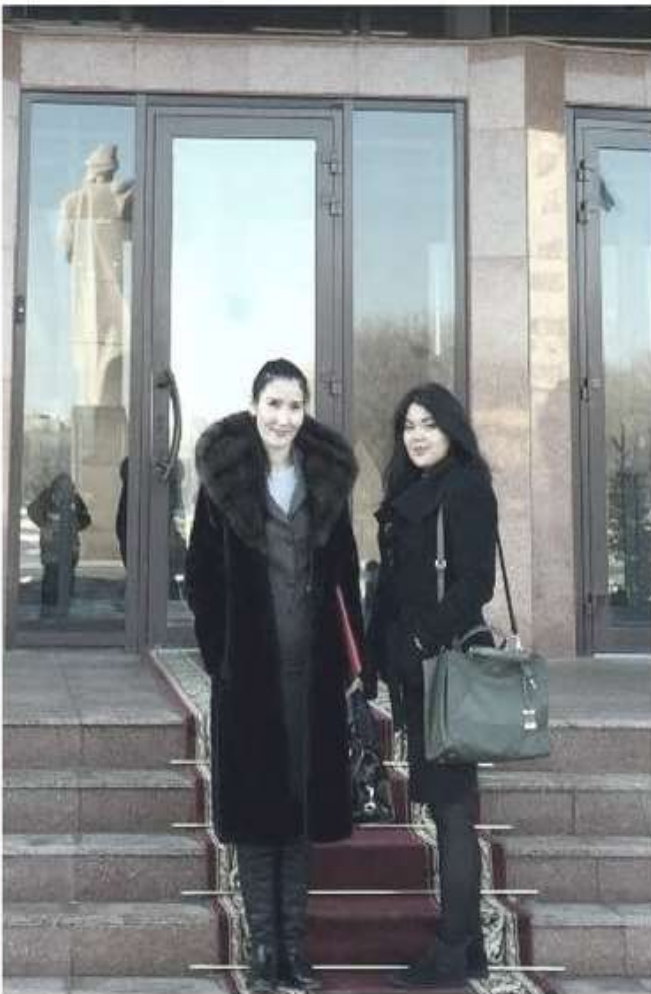
Representatives of KIDI visiting the City of Atyrau

All these meetings elicited notable interest from all participants and were useful as a previous contact regarding the rules for clusters selection, the main selection criteria, and questions on the process and the project which were answered by the representatives of KIDI in each meeting.